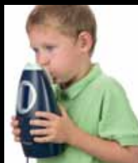
NioxMino asthma monitor . Ergonomidesign. Manufactured by Aerocrine AB. Sweden, 2008. Nitric-oxide sensor, electronics, LCD display, PCBs, ABS plastic.