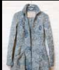
Alabama Chanin, indigo dyed and embroidered couched coat. Alabama Chanin, United States, 2009. 100% organic cotton, natural indigo plant dye, paint, thread, snaps.