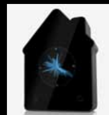
Energy Aware clock , prototype. Interactive Institute AB. Sweden, 2007. Epoxy, polyamide, acrylic, electronic components.