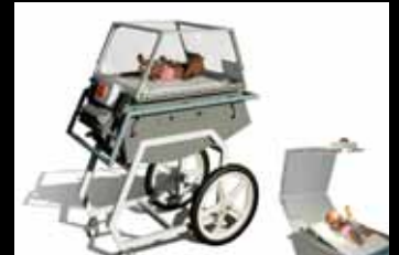
Car-parts incubator , prototype. Design that Matters, Inc. United States and Nepal, 2008–present. Rendering: Design that Matters