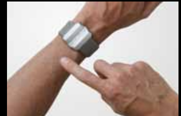
Haptica Braille timepiece , concept. David Chavez. United States, 2007–9. Stainless steel case, rubber strap. Photo: David Chavez