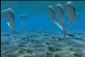
bioWAVE ocean-wave energy system , prototype. BioPower Systems Pty Ltd. Australia, 2005–present.