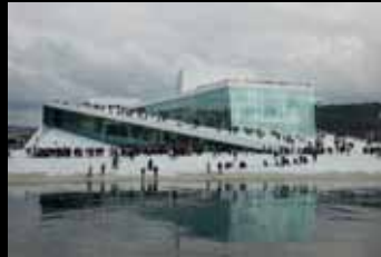
Oslo Opera House . Snøhetta, Norway, 2001–8.