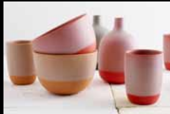
Heath Ceramics tableware . United States, 2005–9. Glazed ceramic stoneware.