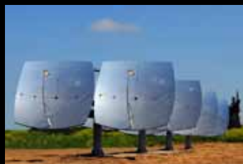
Z-10 concentrated solar-power system . Tarazi Studio. Manufactured by ZenithSolar. Israel, 2009. Polypropylene, mirror glass, stainless steel, photovoltaic components, ceramics, copper.