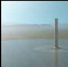
Hope solar tower. EnviroMission Ltd. and Arup; concept: Schlaich Bergerman & Partner. Manufactured by EnviroMission Ltd. Designed Australia, 2005–present.