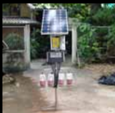
Solar rechargeable battery lanterns . Sunlabob Renewable Energy Co. Ltd. Laos, 2007–present. Plastic, LED light, battery, cigarette lighter socket, recycled “flip-flop shoes” and prosthetic limbs, mirror foil.