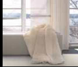
Veil curtain . Woodnotes OY, Finland, 2008. Paper yarn.