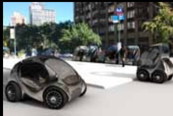
MIT CityCar , prototype. Smart Cities, MIT Media Laboratory, United States, 2003–present. Rendering: MIT Media Lab, Smart Cities