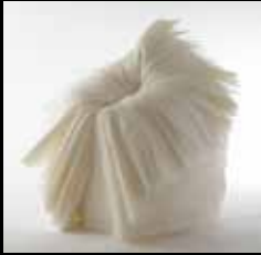
Cabbage chair , prototype. Nendo, Japan, 2008. Pleated paper.