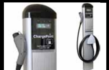
ChargePoint™ networked charging station , bollard. Interform. Manufactured by Coulomb Technologies, Inc. United States and Denmark, 2008–present. Aluminum, plastic, various electronics.